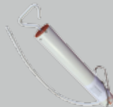
Internal design of bag